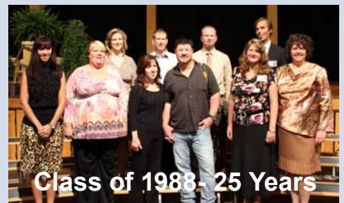
Class of 1988- 95 Years