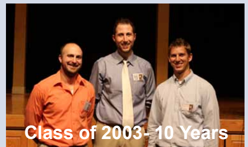
Class of 2003- 10 Years