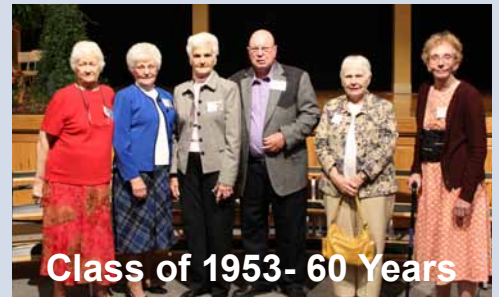
Class of 1953- 60 Years