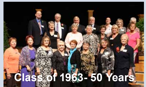
Class of 1963- 70 Years